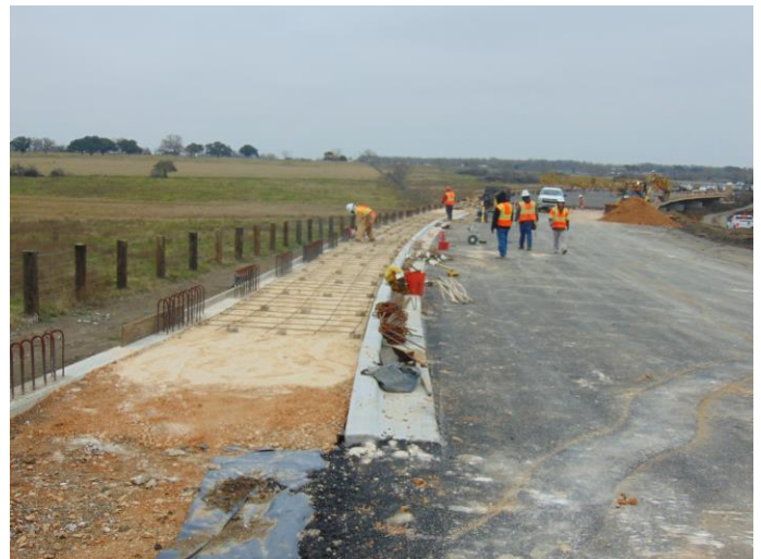
Maha Loop Construction