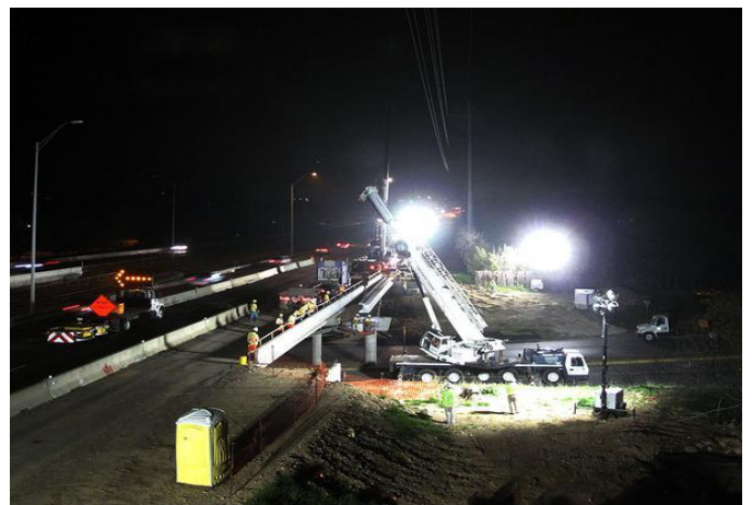
Crews set the beams for the northbound MoPac bridge over 45th St. overnight (March 17, 2015)