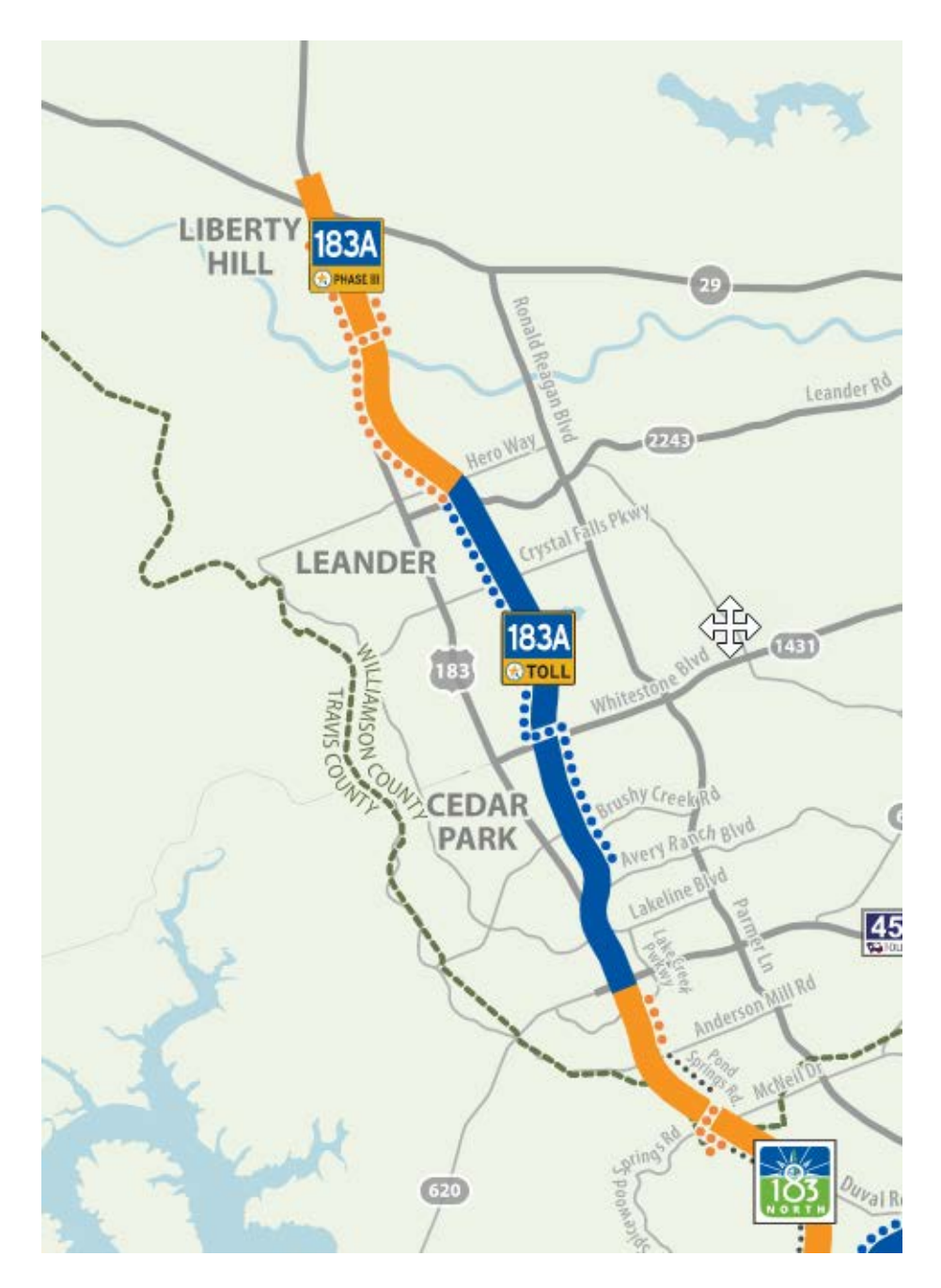
Electronic Toll Collection System Integration and Maintenance Services WA 05 - December 14, 2022