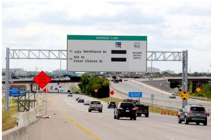
New Express Lanes signage posted at Southbound MoPac just north of Parmer Lane (Oct.8)