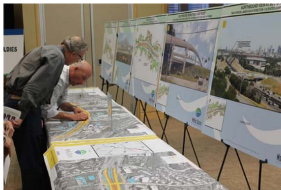
MoPac South Open House Nov. 10, Palmer Events Center