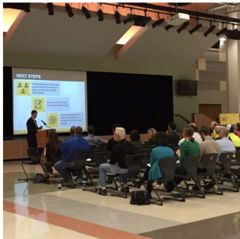
183 North Public Hearing November 12, 2015, Westwood High School

general-purpose lane. The CAMPO Technical Advisory Committee conditionally approved the proposed amendment on November 18, 2015; requesting the Mobility Authority continue to investigate transit, bike, and pedestrian accommodations.