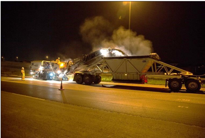
Mill and Overlay crew on 183A

Construction crews continue to work overnight to on the 183A Mill and Overlay project. The project will remove and replace the top two inches of the 18-inch thick pavement along the frontage roads. The resurfacing process is expected to be finished by the end of November. Various lanes and ramps have been closed during evening hours to accommodate the activity on the project