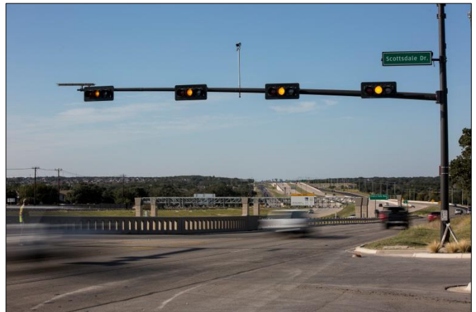
Traffic signal activated at 183A frontage road and Scottsdale Drive

Electronic message signs are in place to alert drivers of the new signal which will become fully operational on Tue. October 28.